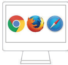
PC and Mac Chrome | Firefox | Safari

1 Use a computer or device with camera/microphone